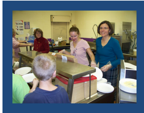
Family Fun Night provided fun and food for all!