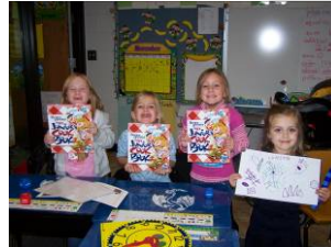
Health & Nutrition