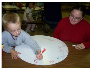
Family Game Board Making

Thank you to families who participated and helped make our events a success!