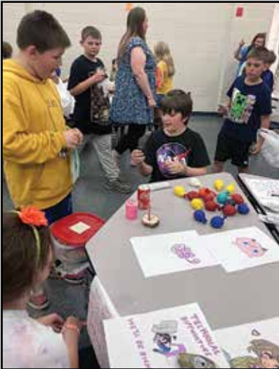
▲ CSI students participated in market day in late May.