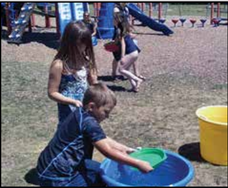
◀ Rapid City Elementary students enjoyed field day.