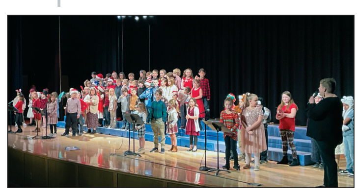
Kalkaska Upper Elementary performed its first–ever Holiday Concert on Thursday, December 14.

There is a great amount of ground to cover throughout the remainder of the