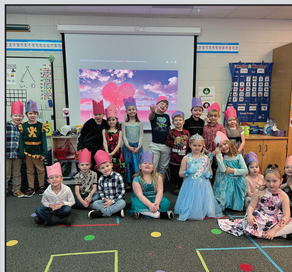
Photos include our Bingo Winners, the Kindergarten Royal Ball, and 100's Day.