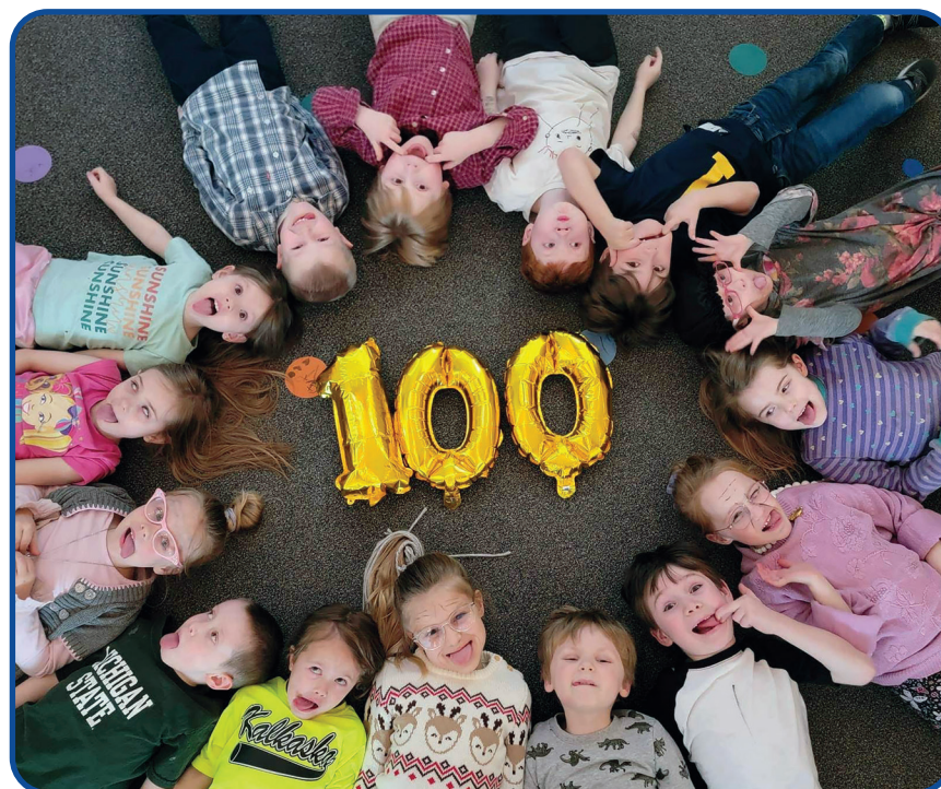
▲ Birch Street Elementary students recently celebrated the 100th day of the 2022-2023 school year.