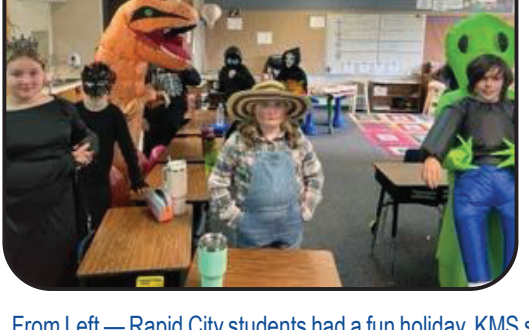
From Left — Rapid City students had a fun holiday. KMS students had a great time. The KUE students and staff enjoyed the festivities, as well.