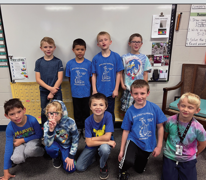
Students at BSE enjoy the festivities! October was busy at BSE.